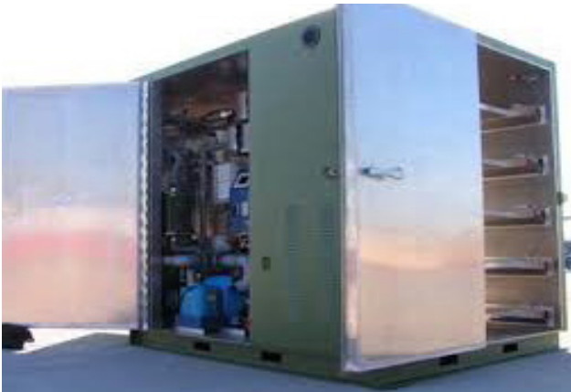
Price Range: INR 25000 to 2 lakhs

Sterilisation of surfaces can be achieved by hydrogen peroxide (H 2 O 2 ) cloud or low-temperature plasma which is produced by a strong electrical field. Hydrogen peroxide plasma is formed directly in the sterilisation chamber. During hydrogen peroxide gas plasma sterilisation process, the air from the chamber is removed by applying vacuum after placing the surfaces to be sterilised like medical devices and surgical instruments. Before starting each sterilisation cycle, the operator inserts the self-contained cassette of the solution of 58% of hydrogen peroxide and water, and this solution is injected into an outer chamber. The solution is then vaporised and allowed to diffuse throughout the sterilisation chamber, enveloping the items required to be sterilised. An electromagnetic field is created by applying radiofrequency energy initiates the generation of gas cloud or plasma. At the end of the sterilisation cycle, the electromagnetic field is turned off, and the reactive hydrogen peroxide is converted into water vapour and oxygen. The sterilisation chamber is re-pressurised, and the air passed through an activated charcoal filter to remove any residual hydrogen peroxide.