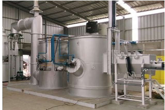
Price Range: INR 2 lakhs to 22 lakhs

Biomedical waste is generated while performing procedures and treatment on patients in hospitals, diagnosis in laboratories and in R & D facilities during research activities or in the production and testing of biological and medical sources in hospital, clinic, research institute etc. It contains infectious micro-organisms, viruses etc.