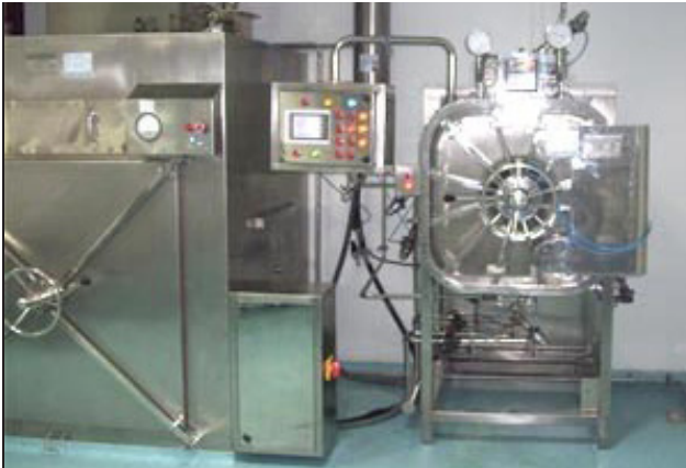
Price Range: INR 1 lakhs to 10 lakhs

Autoclaves are used in sterilising the equipment, instruments or packages that can withstand the temperature range. Air is removed from the chamber by means of vacuum pumps to create a low-pressure. Moist heat, in the form of pure steam, has better heat transfer capabilities and is more effective in destroying micro-organisms and spores as compared to dry heat. That is the reason for removing trapped air so that the steam is not diluted by air.